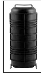
FST / MRBU Closure Cover