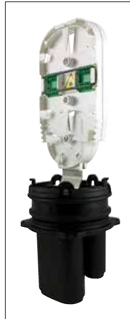
FST 4 Port Closure with 2 Hellapon Small Trays